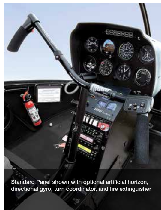
Standard Panel shown with optional artificial horizon, directional gyro, turn coordinator, and fire extinguisher