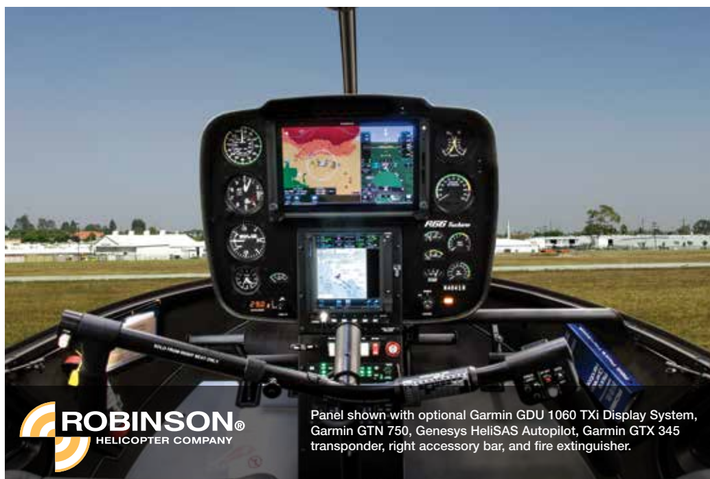
Panel shown with optional Garmin GDU 1060 TXi Display System, Garmin GTN 750, Genesys HeliSAS Autopilot, Garmin GTX 345 transponder, right accessory bar, and fire extinguisher.